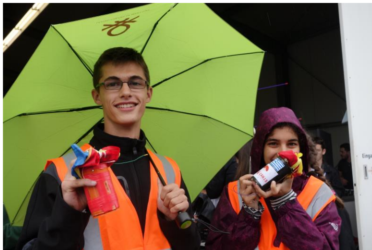
Students with their CanSats ready for launch during the 2017 European CanSat Competition

A CanSat can simulate an exploration flight to a new planet, taking measurements on the ground after landing. Teams should define their exploration mission and identify the parameters necessary to accomplish it (e.g. pressure, temperature, samples of the terrain, humidity, etc.).