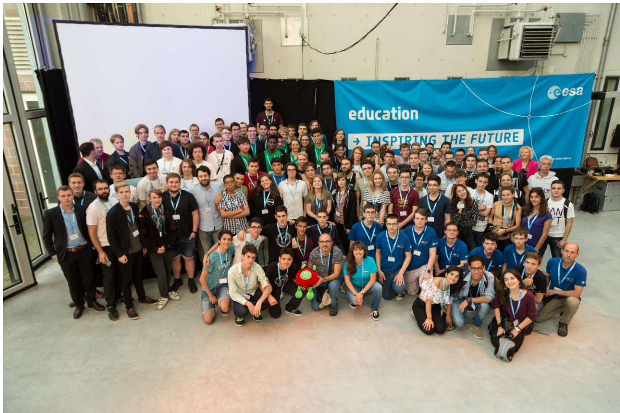
Participants of the 2017 European CanSat Competition at ZARM in Bremen

A CanSat is a simulation of a real satellite, integrated within the volume and shape of a soft drink can. The challenge for the students is to fit all the major subsystems found in a satellite, such as power, sensors and a communication system, into this minimal volume. The CanSat is then launched by a rocket to an altitude of about one kilometre, or dropped from a platform, drone or captive balloon. Then its mission begins. This involves carrying out a scientific experiment, achieving a safe landing, and analysing the data collected.