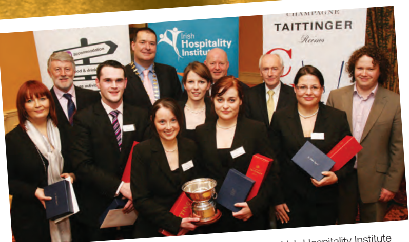
BBus in Hospitality Management students win the 2009 Irish Hospitality Institute Business Management Game in Galway.