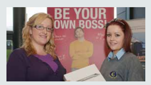
During the CIT Open Day, November 2011, CIT ran a "Bright Ideas" competition for second level students to get them to start thinking about new products/businesses.

In addition to the CIT Prize for Innovation Awards there are a number of events throughout the year to inspire entrepreneurial spirit on campus. The 'Fugitive' Competition run by the (entrepreneurial) Ideahub Society encourages students to learn about the entrepreneurial ecosystem on campus in a fun and engaging way. Lucky winners who do their research and find the fugitive receive a cash prize.