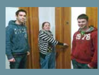
Kipp-Grip Biomedical Engineering/ Mechanical Engineering