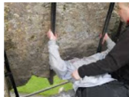
Blarney Stone Legendary stone granting gift of the gab