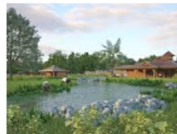
Fota Wildlife Park Vast park with exotic animals & plants