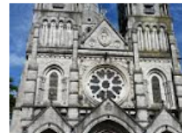
Saint Fin Barre's Cathedral Victorian Gothic edifice with spires