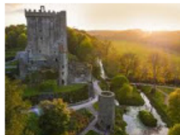
Blarney Castle Medieval castle keep & baronial mansion